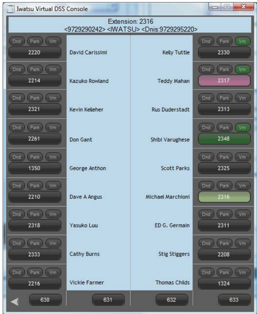
Center Display Option